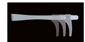
New movable ear hook gives better fitting