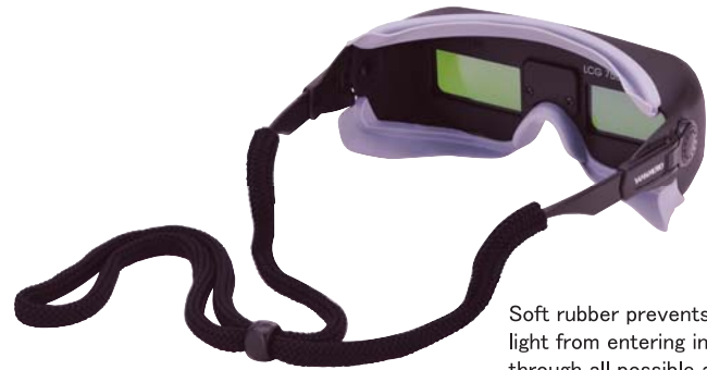
Soft rubber prevents scattered light from entering into the goggle through all possible angles.