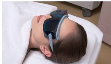
Shutter open: Clear view through open LCD shutter