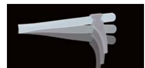
New straight and angle adjustable temples which have three adjustable angle positions.